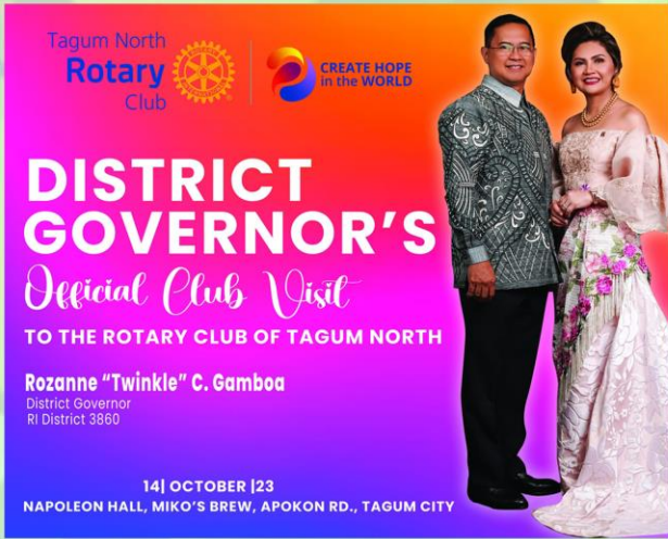
District Governor's & Team Visit at Napoleon Hall, Miko's Brew last October 14, 2023