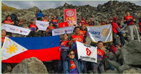
Mt. Apo Climb End Polio Now awareness campaign and fund raising events on October 27-29, 2023